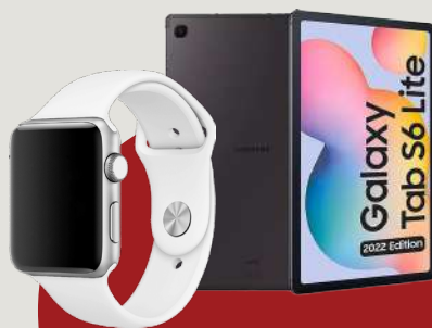
2nd Prize Grade 4-6: Tablet Grade 7-8: Apple Watch