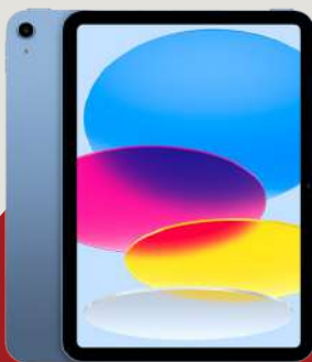
1st Prize All grades: iPad