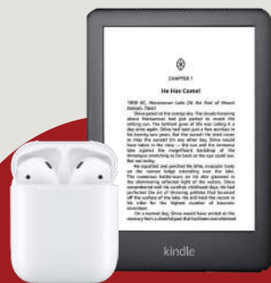
3rd Prize Grade 4-6: Kindle Grade 7-8: Apple Airpod